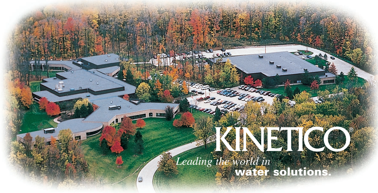
Community Water Systems