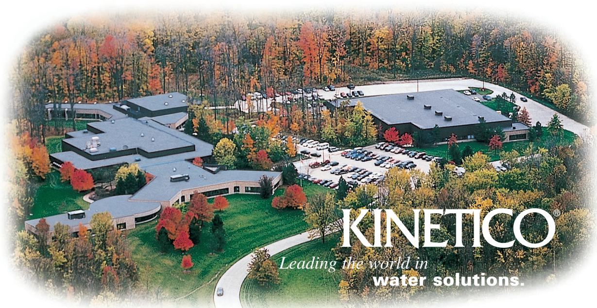
Community Water Systems